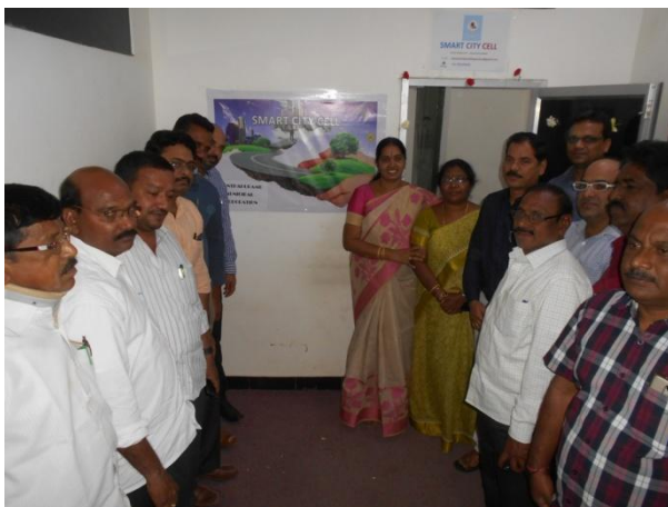
Opening of Smart City Cell

Also as an initial step, a Smart city cell has been opened in the corporation office for collecting public opinion and suggestions on the Smart City Project. This is an important way to connect with the common people and design a city according to their dreams. Meetings were held with Commissioner and Mayor for discussing a structured approach on how to proceed with the project and make Anantapur as developed as Bhubaneshwar and Udaipur Smart cities.