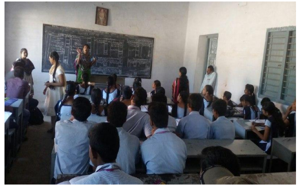
Awareness Programme on Citizen Feedback